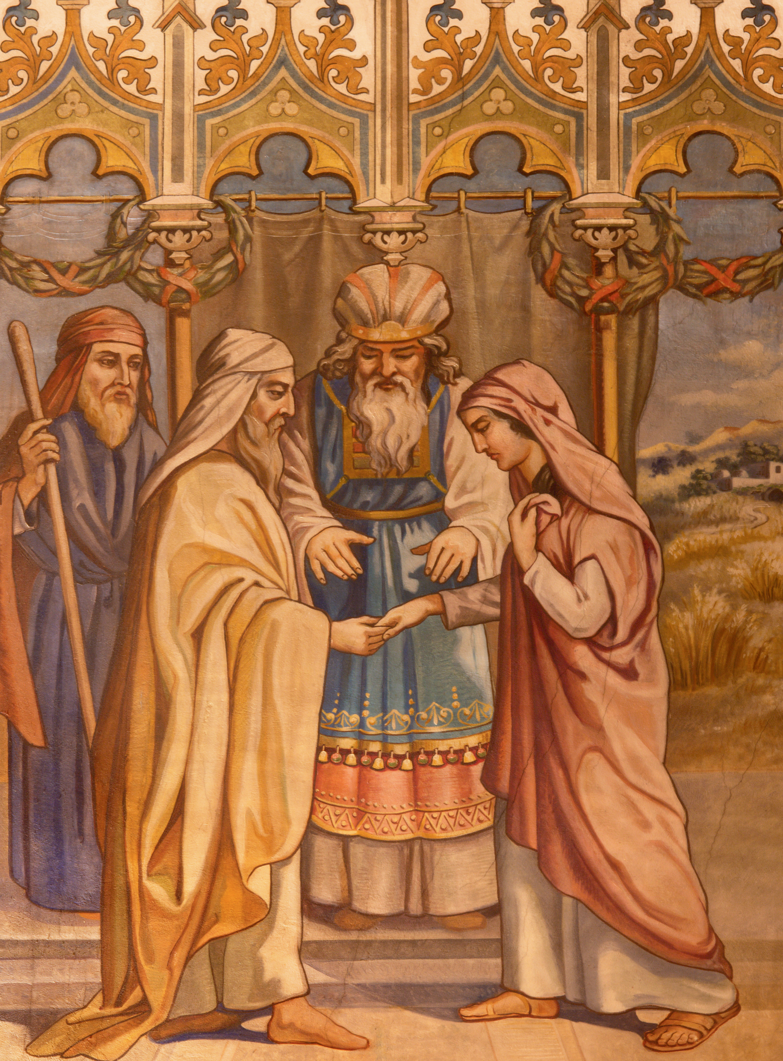
Fresco of Boaz and Ruth Wedding