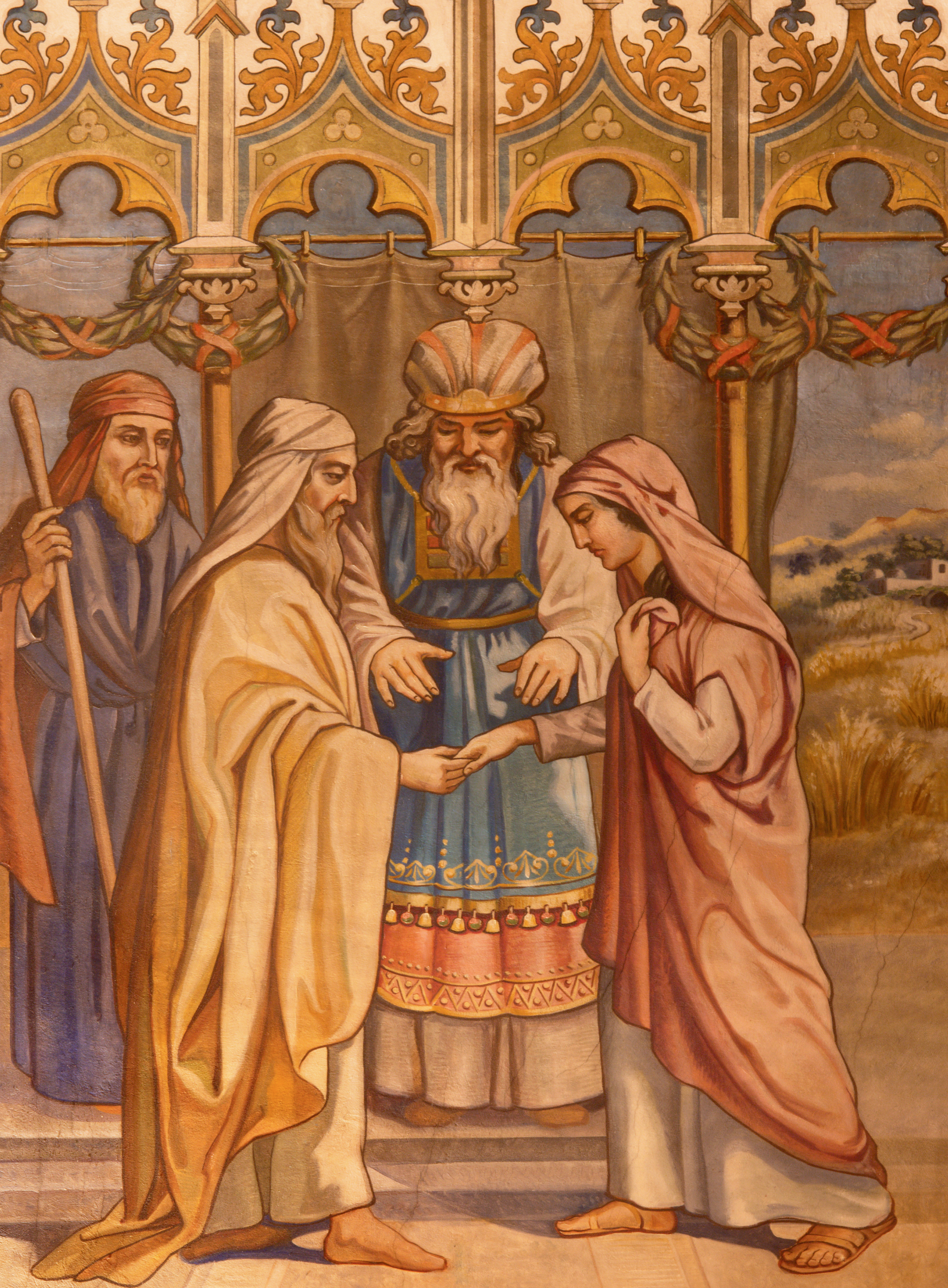
Fresco of Boaz and Ruth Wedding